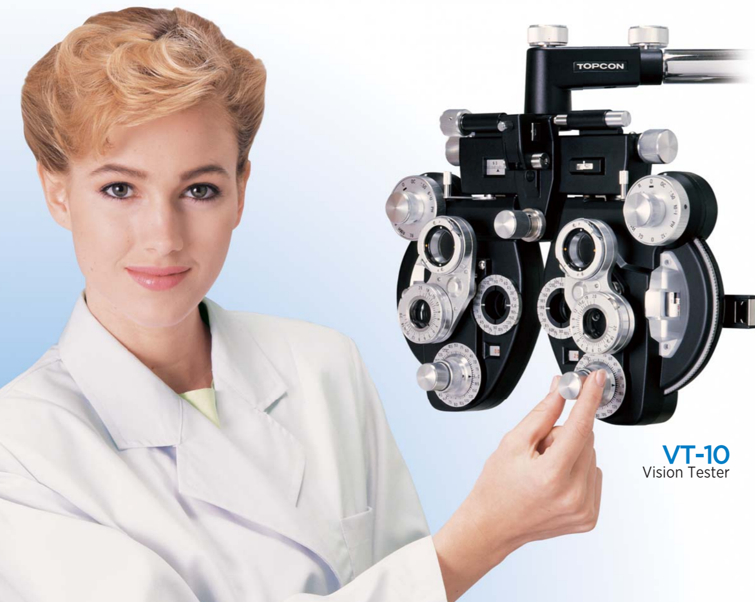
VT-10 Vision Tester

Precision and convenience are a tradition in high quality TOPCON optical instruments. The VT-10 vision tester advances this tradition still further, making refraction quicker and easier than ever before, providing unequaled performance and exceptional versatility. Precision in design and workmanship guarantees accuracy in refraction measurements—accuracy that won't deteriorate even after long years of use. Total quality from TOPCON means you can have total confidence in the performance you'll enjoy from the VT-10 vision tester.